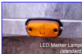
LED Marker Lamps (standard)