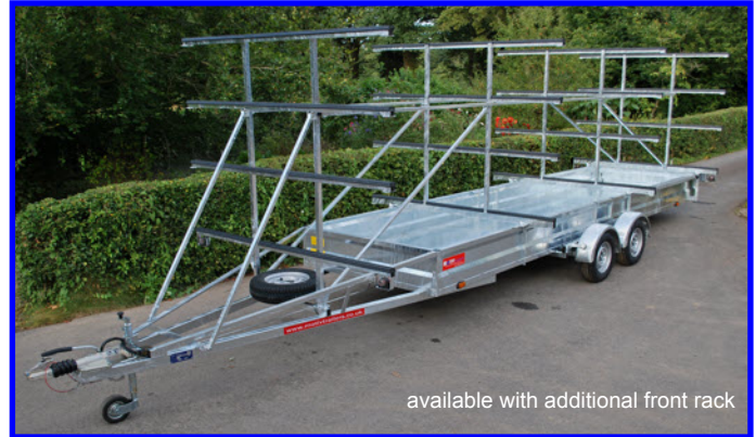
available with additional front rack

Successfully used by larger organisations with the ability to transport and safely store numerous boats and equipment without the risk of damage or sagging. The design has evolved to meet customer requirements and can be adapted to suit individual needs.