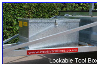
Lockable Tool Box